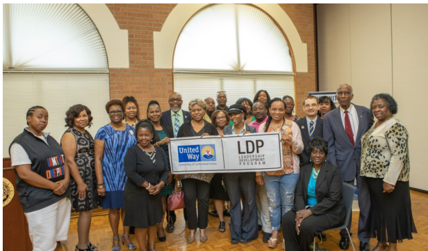
UWCC LDP Alumni

Location: FTCC Tony Rand Center (6:00PM—8:00PM)