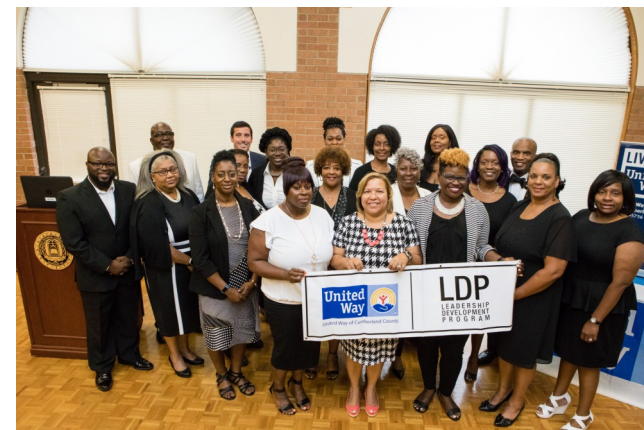
2019 Leadership Development Program Graduates

Training and placing volunteer leaders onto local boards and committees